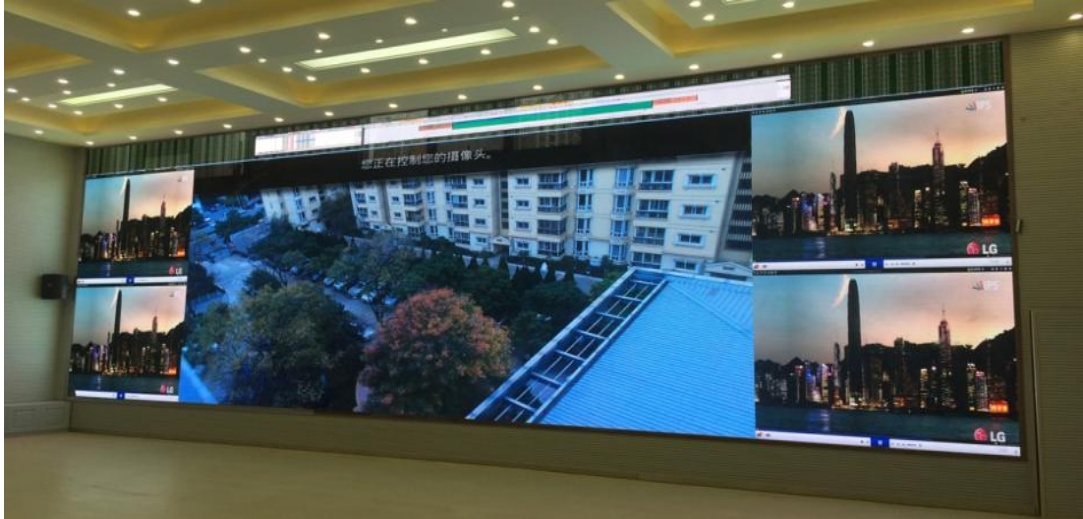
UTV1.6 | 46 sqm | Monitor and Command Center of Forest Public Security of Yunnan Province