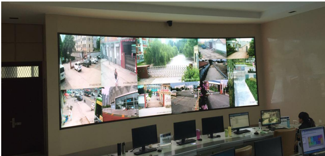
UTV1.9 | 17.28 sqm | Traffic Monitor and Command Platform