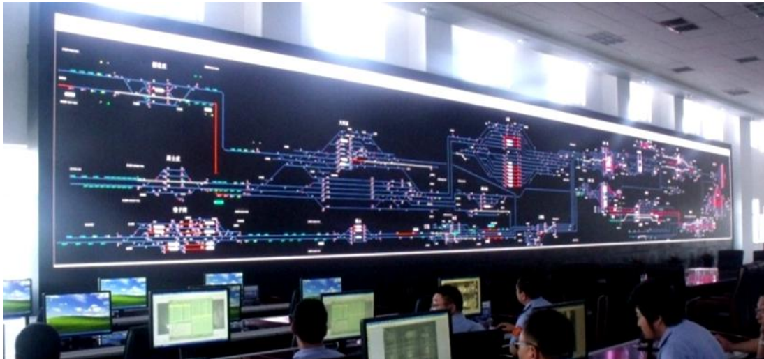
UTV2.5 | 74 sqm | Datong Railway Monitor and Command Center